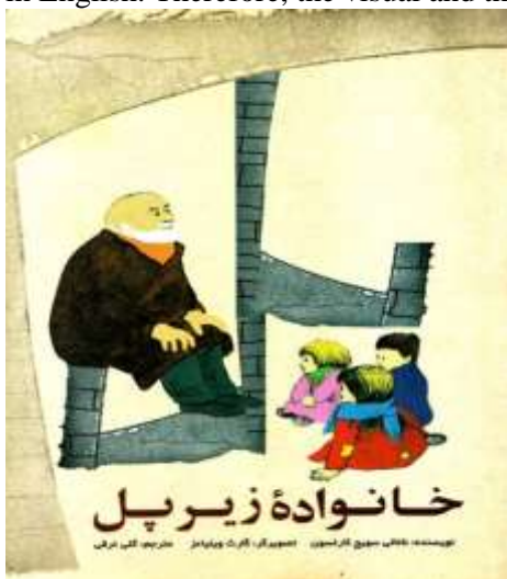
Picture 5. Contradictory interaction in the logotype of the title of the novel The Family under the Bridge by Carlson (2008)

In the title of the novel The Family under the Bridge by Carlson (2008), translated into Persian as پل, instead of the three dots under the first letter of the title, the pictures of the three children of the family (three characters in the novel) are used (picture 5). Regarding the meaning of the word family, the picture of the children and the old man represents the members of a family. Although the children are close to each other (like the dots of the letter پ), there is a distance between them and the old man created by the word ل or L in English. Therefore, the visual and the readable aspects of the logotype stand in contrast to each other.