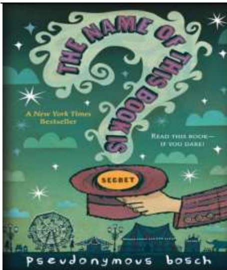
Picture 4. Combined interaction in the typography of the title of the novel The Name of this Book Is Secret by Bosch (2008)

5. Contradictory interactions: In contrast to the symmetrical interaction in which the visual and verbal implications go alongside each other, in contradictory interaction, the signified of the written signifier and the signified of the visual signifier are contradictory to each other.